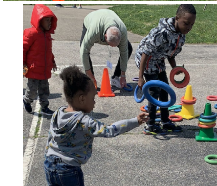
AN EASTER EGG HUNT & PARTY WAS HELD ON SATURDAY, APRIL 16TH, FROM 1-3PM AT PLEASANT HILL ACADEMY (NEXT TO THE LIBRARY) IN COLLEGE HILL. FEATURED WERE AN EASTER STORY WALK, A LIVE BAND, THE EASTER EGG HUNT, LOTS OF GAMES FOR THE KIDS, AND A MAGICIAN WITH SOME FUN EASTER TRICKS UP HIS SLEEVE. THE COMMUNITY EVENT WAS HOSTED BY COLLEGE HILL PRESBYTERIAN.