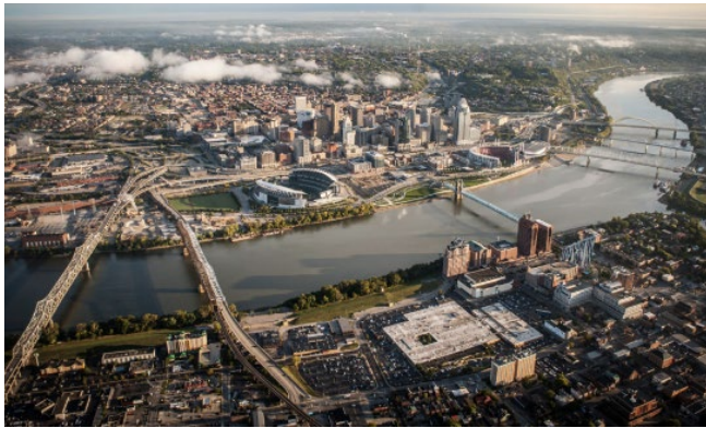
PREPARING THE QUEEN CITY FOR THE KING