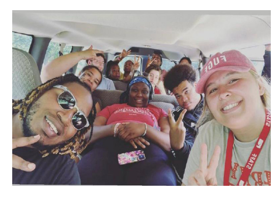
CHPC TEAM AND FUGE CAMP COUNSELOR

Another memorable moment was when one of our group became overwhelmed. She was frustrated with herself. A leader took the student aside and shared about how she, too, got overwhelmed...and that it was okay. From that point on, they were a "safe space for one another." When either felt overwhelmed, they would go somewhere calmer and invest in their friendship with one