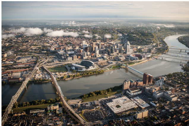
PREPARING THE QUEEN CITY FOR THE KING

Many see their home city, Greater Cincinnati. Others see a place where they are joining with fellow Christians to “raise a canopy of prayer,” to transform the city to be all that God intends.