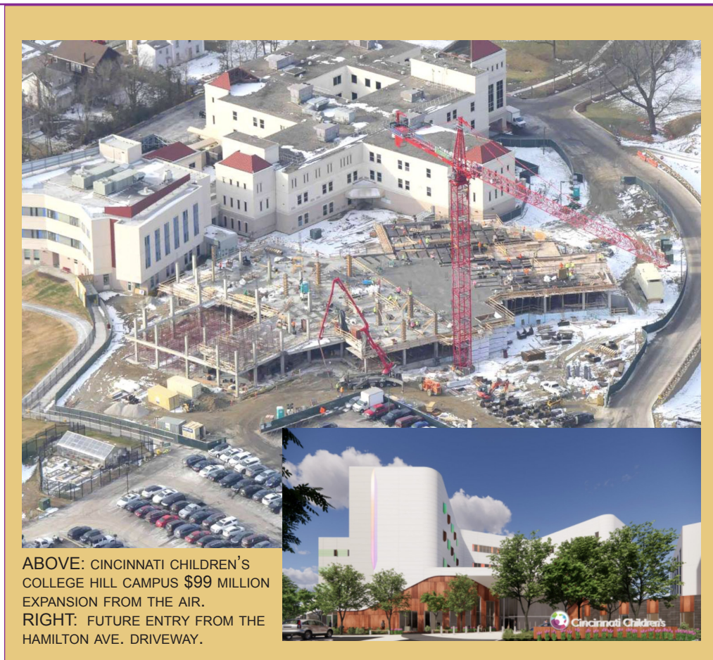
ABOVE: CINCINNATI CHILDREN’S COLLEGE HILL CAMPUS $99 MILLION EXPANSION FROM THE AIR. RIGHT: FUTURE ENTRY FROM THE HAMILTON AVE. DRIVEWAY.

More than a place of treatment, the College Hill campus is part of a mental health system of care that