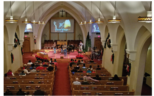
PHOTO CHRISTMAS 2019

Q: The CHPC Christmas decorations appear on the first Sunday of Advent and disappear by the Sunday after the 12th Day of Christmas. Where do they come from and to where do they return? Who does the “decking?” Here are the answers: