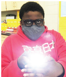
FLASHING “OK” IN MORSE CODE