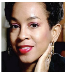
BEBE MOORE CAMPBELL

Last month marked the thirteenth celebration of Bebe Moore Campbell Minority Mental Health Month. Why care? Why is that important to you?