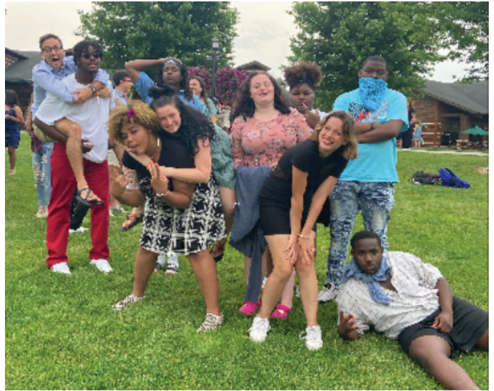
"BEST WEEK OF YOUR LIFE" PROMISE CAME TRUE!

Pictured are the eight Aiken students who returned July 7th from