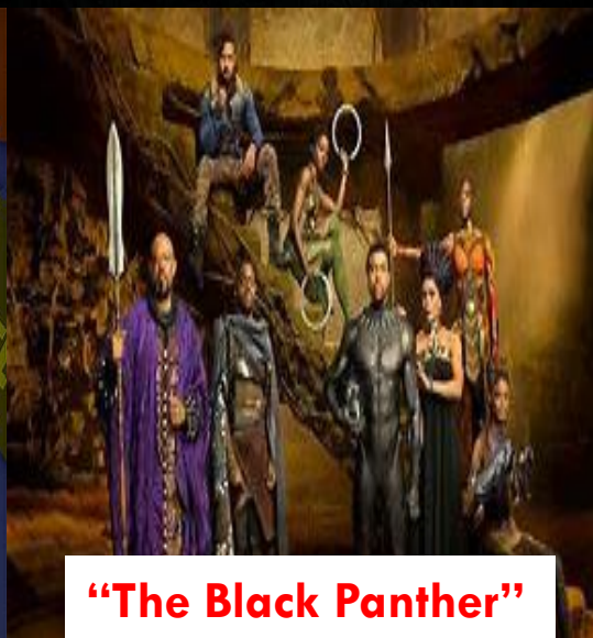
"The Black Panther"