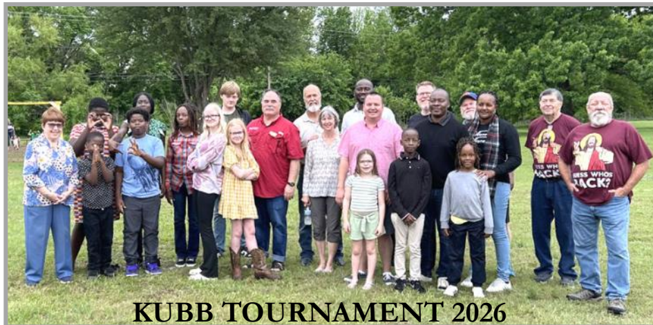
KUBB TOURNAMENT 2026