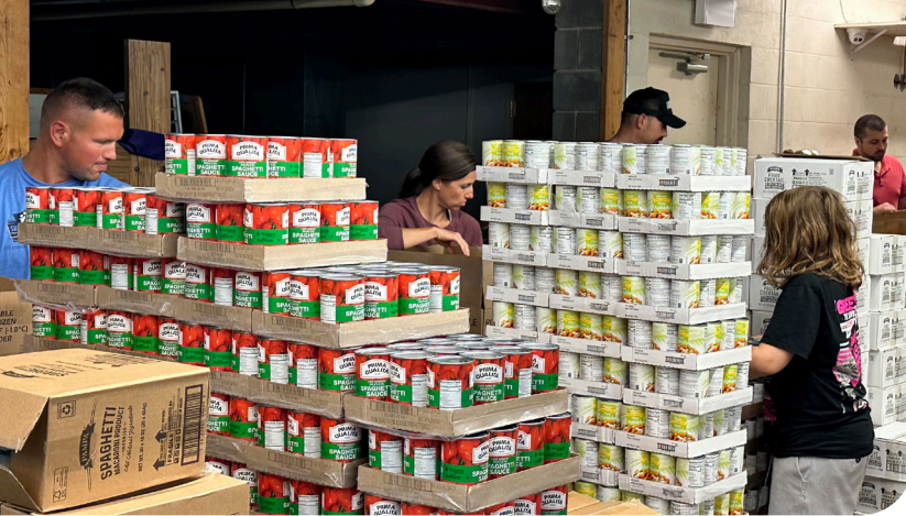
Food-packing with local volunteers.