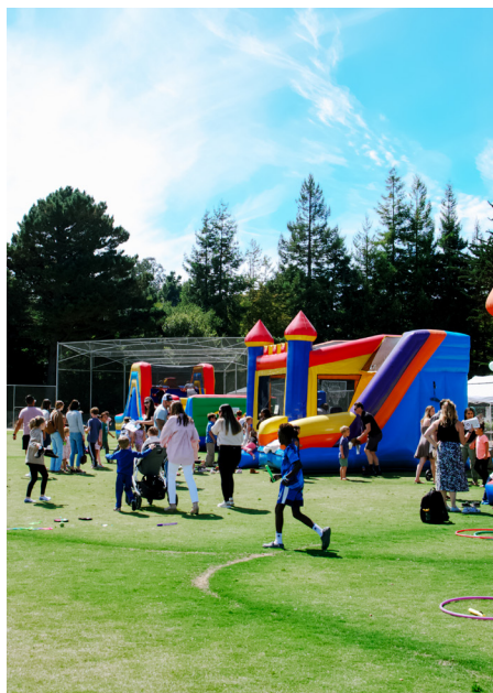
Young Families Park Day