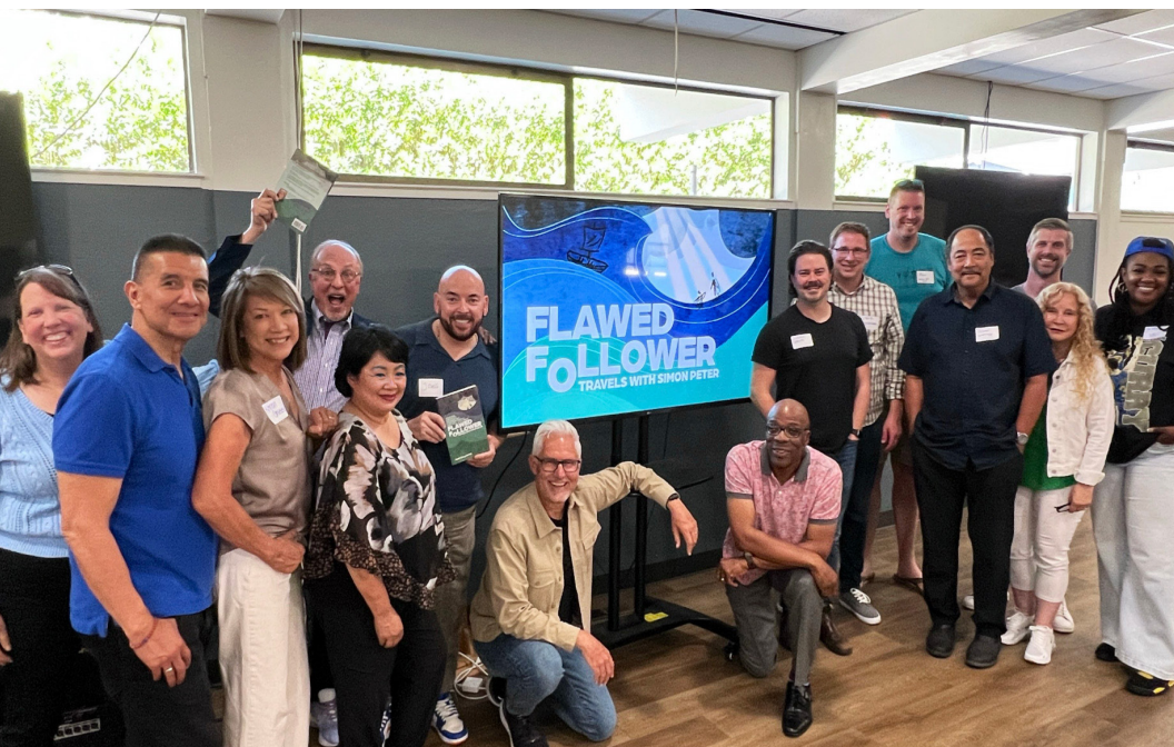
Pastors from some of the many churches using Flawed Follower

For our book about Simon Peter we partnered with several other churches and were surprised that the Kindle and Audible versions reached #1 on Amazon in the "Christian History and Culture" category!