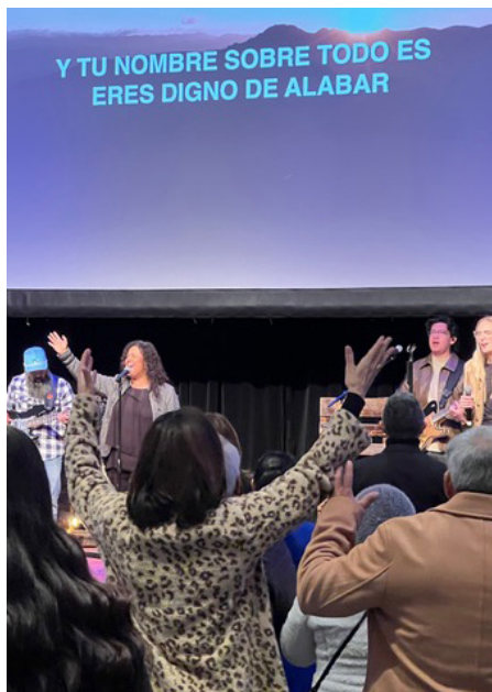
TLC en Español