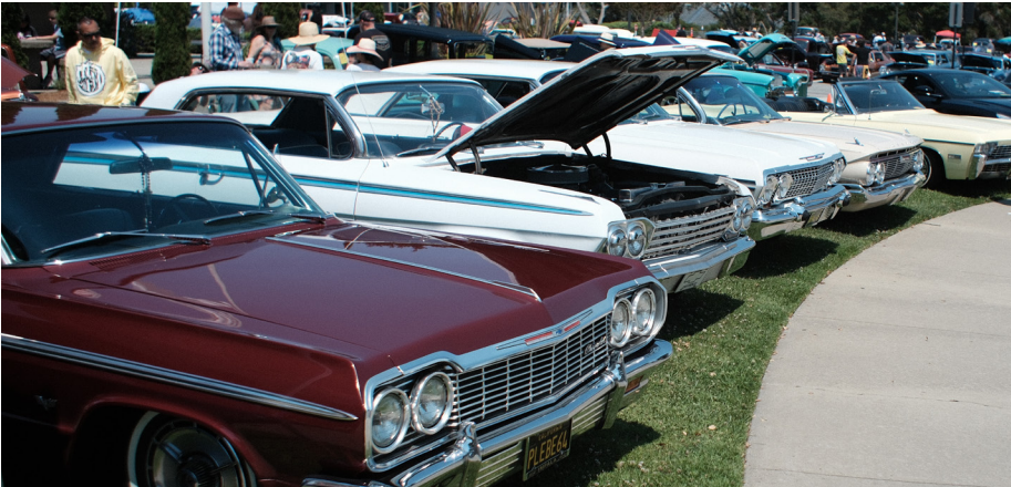
Hot Rods on the Green