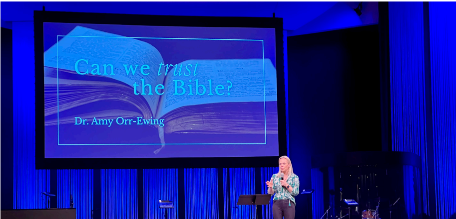
TLC Bible Conference