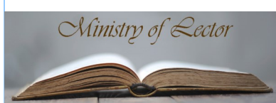
Ministry of Lector

Eucharistic Ministers assists the clergy in administering the elements of Holy Communion, the consecrated bread and wine. They may also take the sacrament to those who are ill or otherwise unable to attend church. A time of fellowship and discussion about this ministry will take place on Sunday, January 26th following the 10:30am liturgy - we'll gather in the Nave.