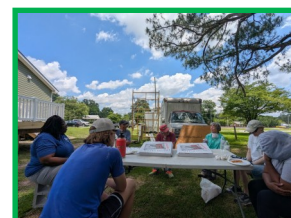
Making work worship Habitat Build