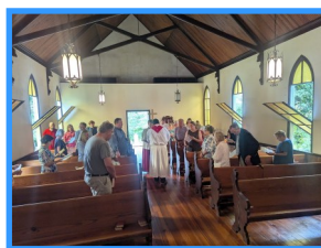
St. Barnabas Service