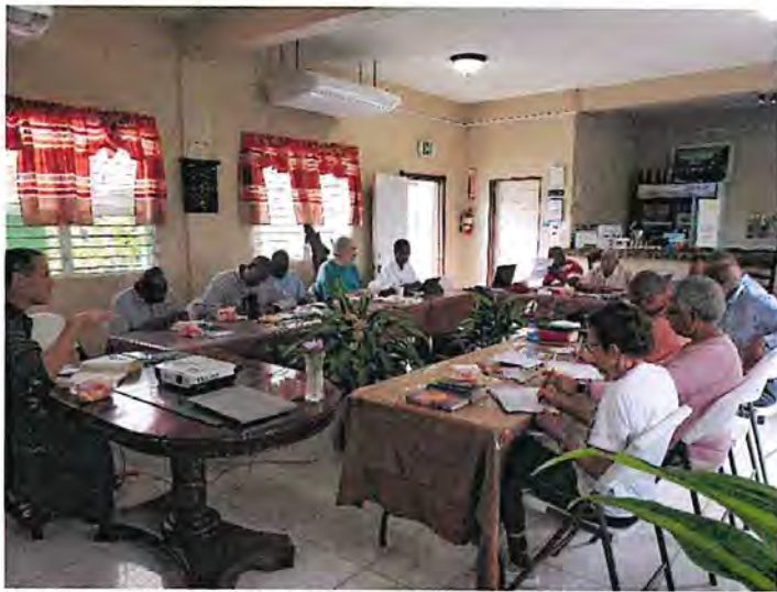
Pastors met in Ministerial Retreat from the 18 th to 20 th January

The 163 rd Annual Meeting of the Belize/Honduras District of the Methodist Church in the Caribbean and the Americas (MCCA) convened from January 22-26 at Wesley Church in Belize City. Prior to the Conference, the Ministers met in Ministerial Retreat from the 18 th to 20 th January. The Conference met under the theme: "Celebrating our Methodist Heritage: Pressing on for Jesus Today!" "Celebrando nuestra herencia Metodista: Hania adelante hoy, para Cristo." This will be the District theme over the next year.