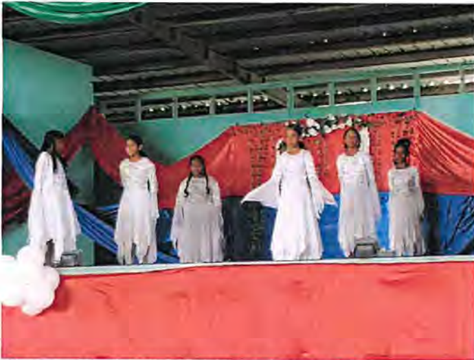
Choreography by a Sunday school class at the closing ceremony of the Conference

Members of the Conference were delighted to share in the very positive and well-attended Youth Service at Bird's Isle in Belize City and to share in the parade thereafter.