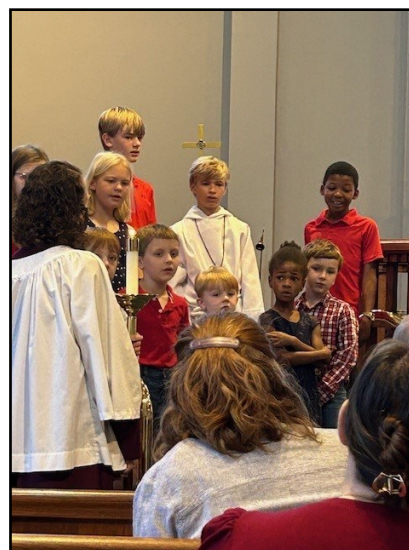
May 5 and 19 Children singing and playing the organ in worship.