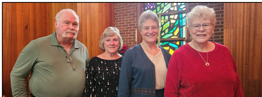
President, Vice President, Treasurer, Secretary