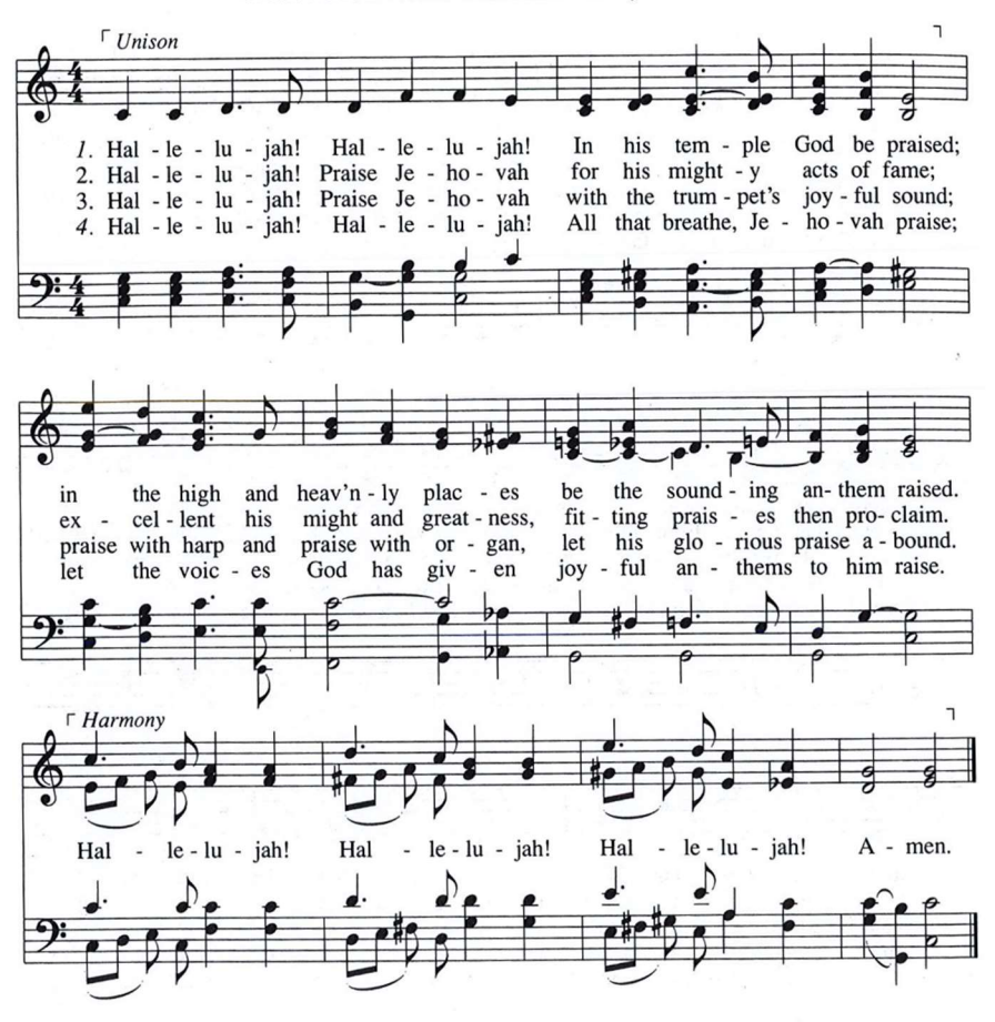
Praise the LORD. Praise God in his sanctuary. Ps. 150:1