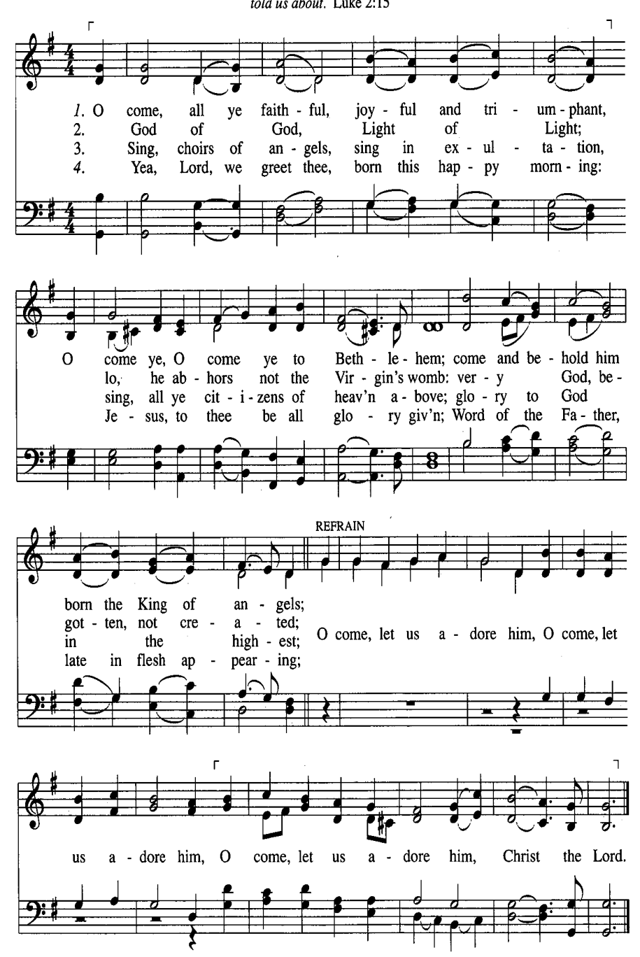
Let's go to Bethlehem and see this thing that has happened, which the Lord has told us about. Luke 2:15