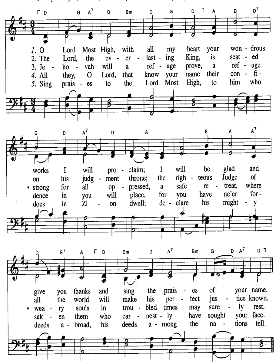
Psalm 9:1, 2, 7-11 The Psalter, 1912; alt. 1990, mod.

I will praise you, O LORD, with all my heart; I will tell of all your wonders. Ps. 9:1