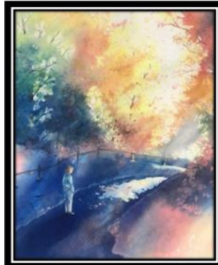
Original artwork by Leni Sovacool