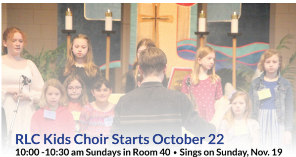
RLC Kids Choir Starts October 22 10:00 - 10:30 am Sundays in Room 40 • Sings on Sunday, Nov. 19