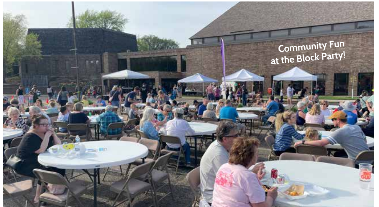
Community Fun at the Block Party!