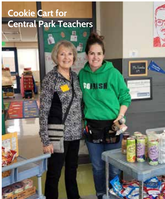
Cookie Cart for Central Park Teachers

Give now at: www.rosevillelutheran.org/praise