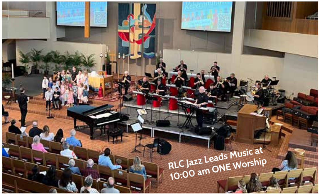
RLC Jazz Leads Music at 10:00 am ONE Worship