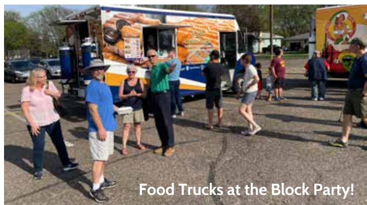
Food Trucks at the Block Party!