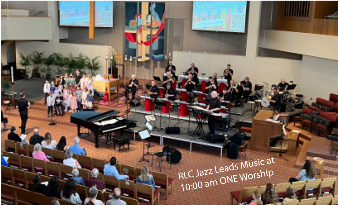
RLC Jazz Leads Music at 10:00 am ONE Worship

Please continue to pray for the work of these task forces and Council as they continue to explore and discern upcoming discussions and decisions.