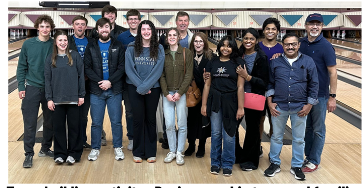
Team building activity. Revive worship team and families