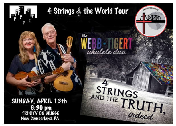
Ukulele music from Nashville, TN Brief music foretaste in morning services that day. Bring your friends to the concert.