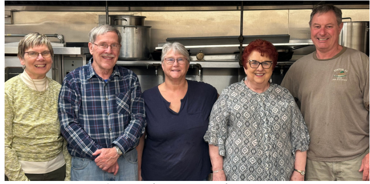
Wednesday Study Dinners Hosting team members