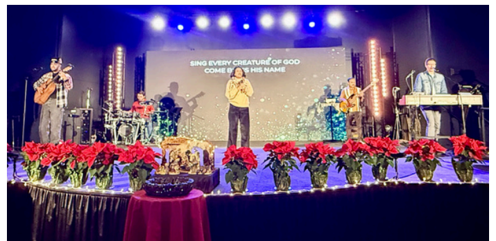
Revive Christmas with the poinsettias on stage.