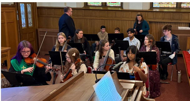
Trinity youth playing different instruments in the Traditional Service on November 23.

The Grandparents in Prayer will host a Christmas party for our prayer buddies on Sunday, January 11 in the Fellowship Hall from 12:30 PM to 2:30 PM. We will eat lunch together and have a time for interaction, prayer and games. We will end by sharing our gifts with our youth prayer buddies. Grandparents in Prayer supports 23 youth prayer buddies, who attend either Trinity's Sunday services or Wednesday evening youth group.