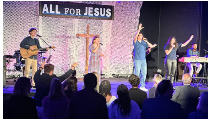
Worship at Revive blesses University Students