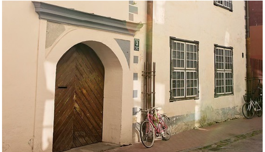
The street view of Lutera Akadēmija in Old Rīga.

To be added to or removed from this mailing list, send an email message to lindsay.cundiff@lcmsintl.org with the word ADD or REMOVE in the subject line.