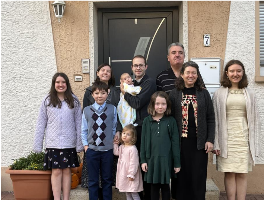
The Ledford Family visiting from South Africa.