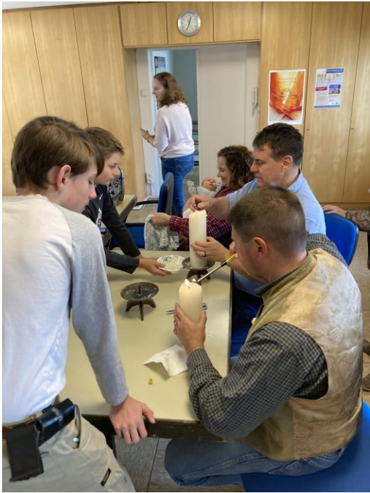
“Trimming the wicks” at Altar Guild/Acolyte breakfast.