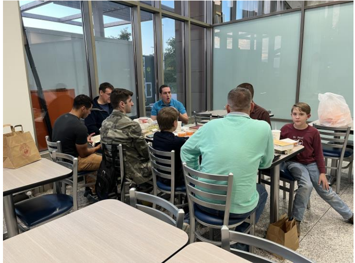
Our KELC men’s group meets once per month at a member’s home and once per month at the Ramstein Air Base food court/mall (the BX).