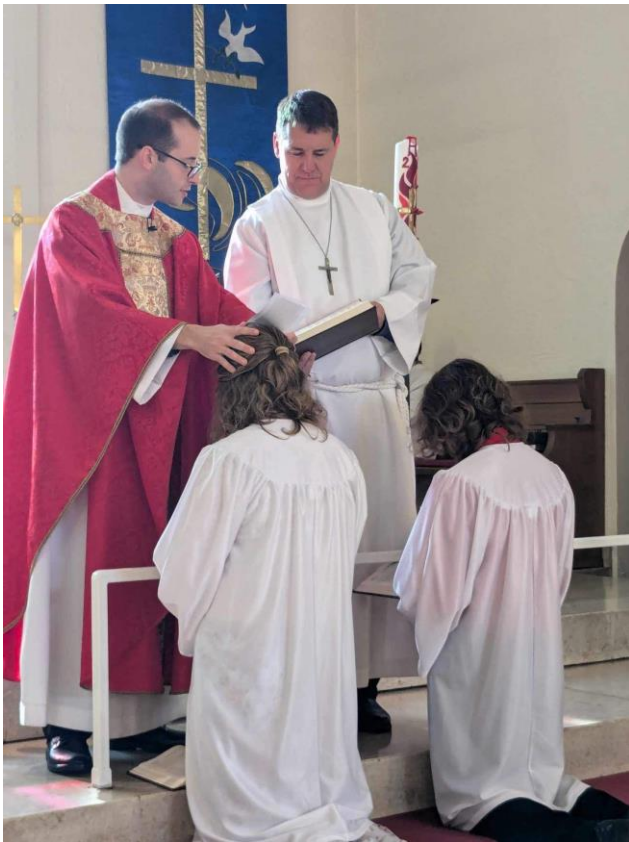
Confirmation at KELC, Reformation Sunday, 2024