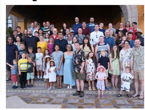
The Eurasia missionaries and their families gather for