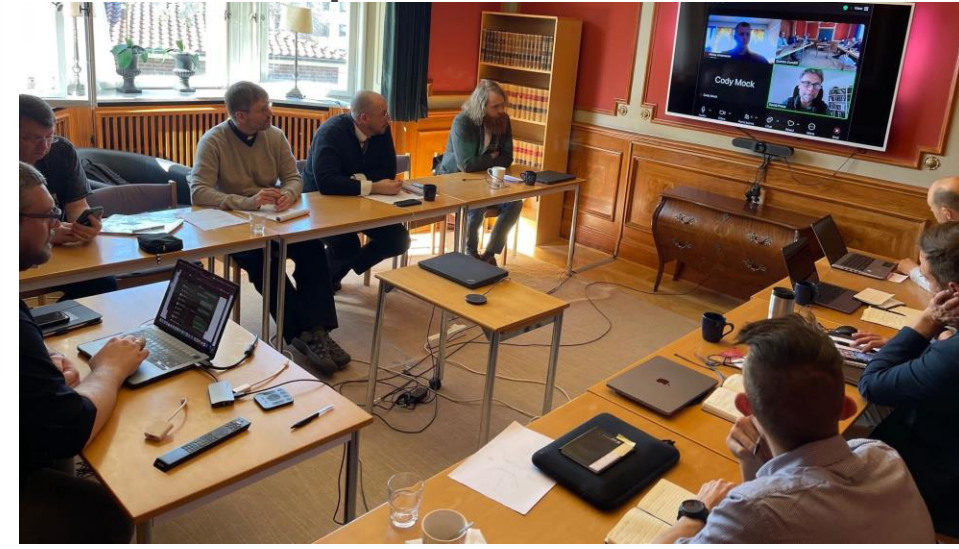
Two theological faculties meet to discuss cooperation in Gothenburg, Sweden, in April 2025.