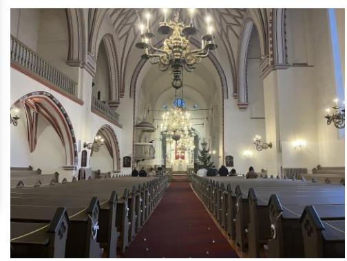
The sanctuary of Svēta Jāņa (St. John) Lutheran Church in Rīga where we hold our English services.

third-largest mission field in the world.