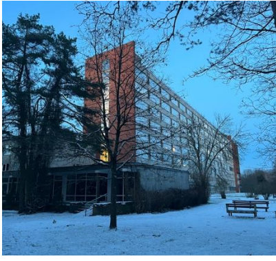
Lindsay visited this hospital nestled in the forest where a Latvian friend convalesced for about a week. Notice how narrow the building is!