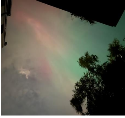
Lindsay caught a bit of the aurora borealis, even in the middle of the city!