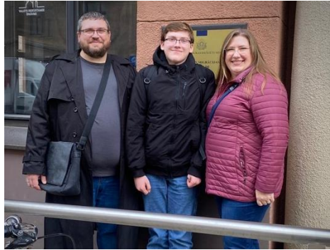
Our annual family photo after visa approval.