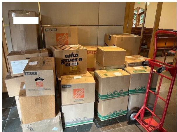
Boxed and ready to go!