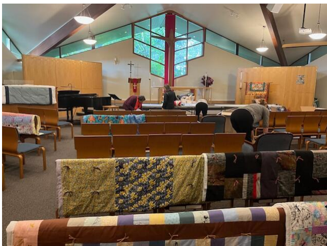
Packing up the quilts and kits.