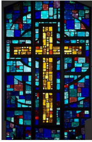
By the Cross We Care