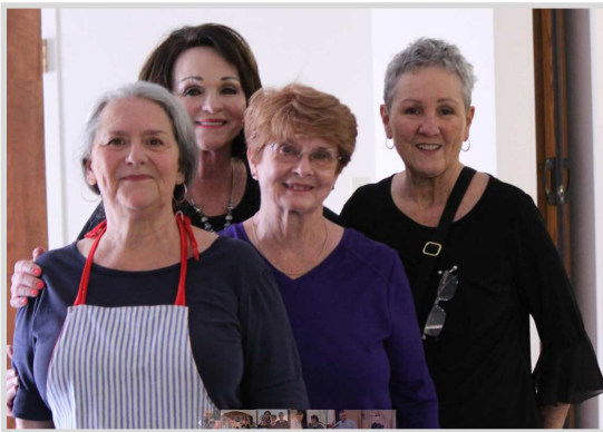
Hardworking kitchen staff