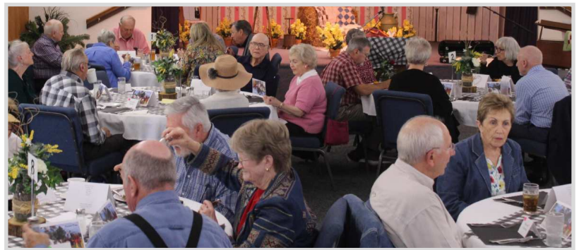
Enjoying the meal