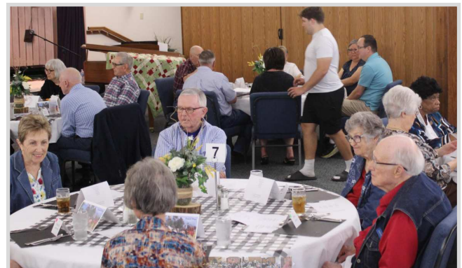
Visiting with friends