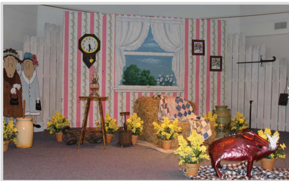
"Pioneer Days" Decorations