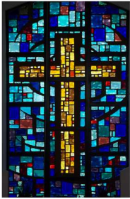
By the Cross We Care