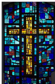
By the Cross We Care One Person at a Time