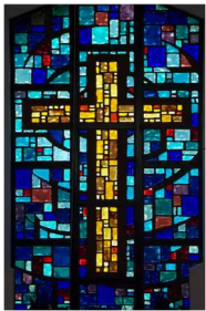
By the Cross We Care One Person at a Time