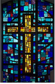
By the Cross We Care One Person at a Time