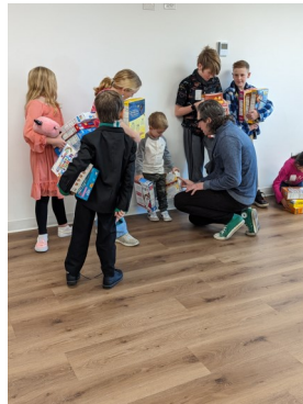
Cereal Box Collecting for Outreach House