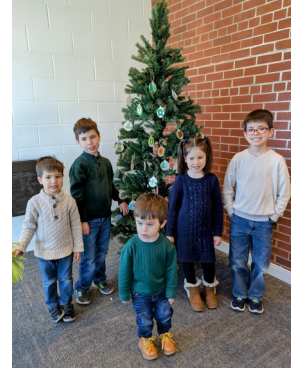
Hat & Mitten Tree Decorating