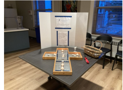
Fall Prayer Vigil