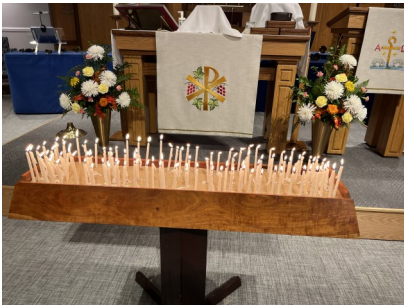
All Saints Service