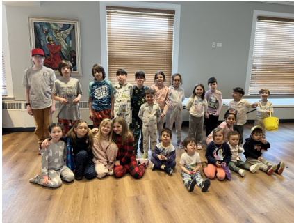
Twenty-two kids and their families enjoyed pancakes and Easter eggs on Sat. March 23rd.

Families had the opportunity to gather at two very different events this month at St. Paul. The first was "Pajamas and Pancakes" held on March 23rd for families with children aged 5th grade and younger. The kids enjoyed a pancake breakfast and an Easter egg hunt.