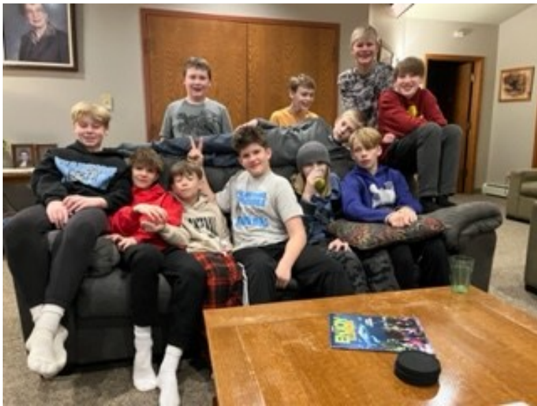
The group relaxing in the common room and visiting the statue of Black Hawk.