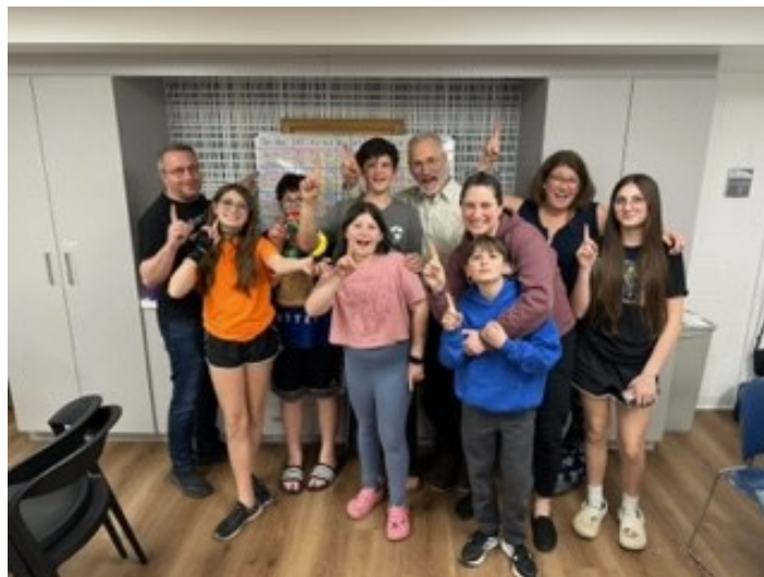
The winning Jackson Jaguars