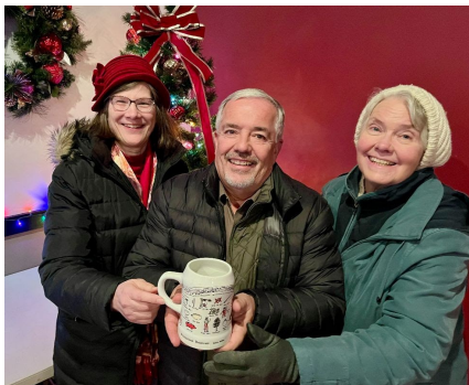
The three finalists for the coveted Name-That-Tune mug at our December gathering.

Cold getting to ya? Come out and warm up your voice AND your spirit. Our next Beer & Hymns event will be on Friday, January 16th at 7pm. In the “back room” at Manny’s Ale House - 683 St. Charles Rd., Elmhurst. Bring a friend or two. Come early to order dinner, if you want.