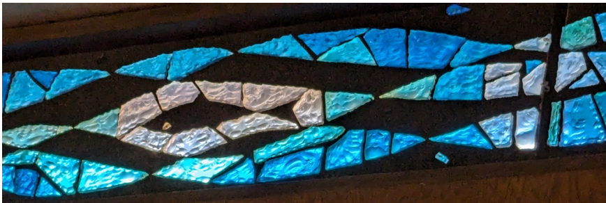
Figure 2 - Appearance of Christ

I believe in Jesus Christ, God's only Son, who was conceived by the Holy Spirit, born of the virgin Mary, suffered under Pontius Pilate, died, and was buried; he descended to the dead. On the third day he rose again; he ascended into heaven, he is seated at the right hand of the Father, and will come to judge the living and the dead.