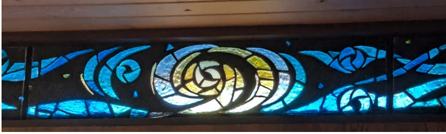
Figure 1 Creation of the world

I believe in God, the Father almighty, creator of Heaven and earth.