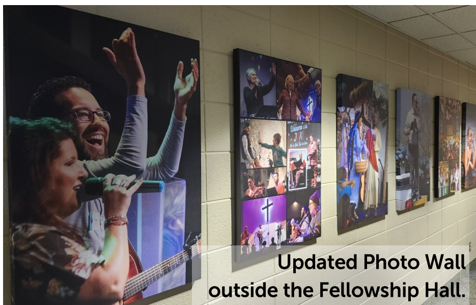
Updated Photo Wall outside the Fellowship Hall.