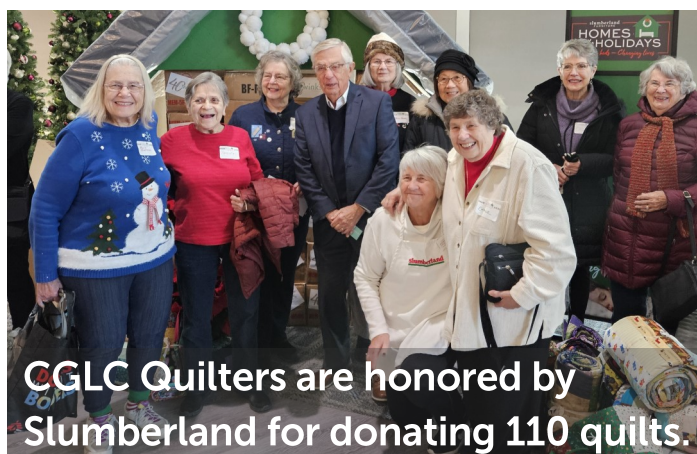
CGLC Quilters are honored by Slumberland for donating 110 quilts.