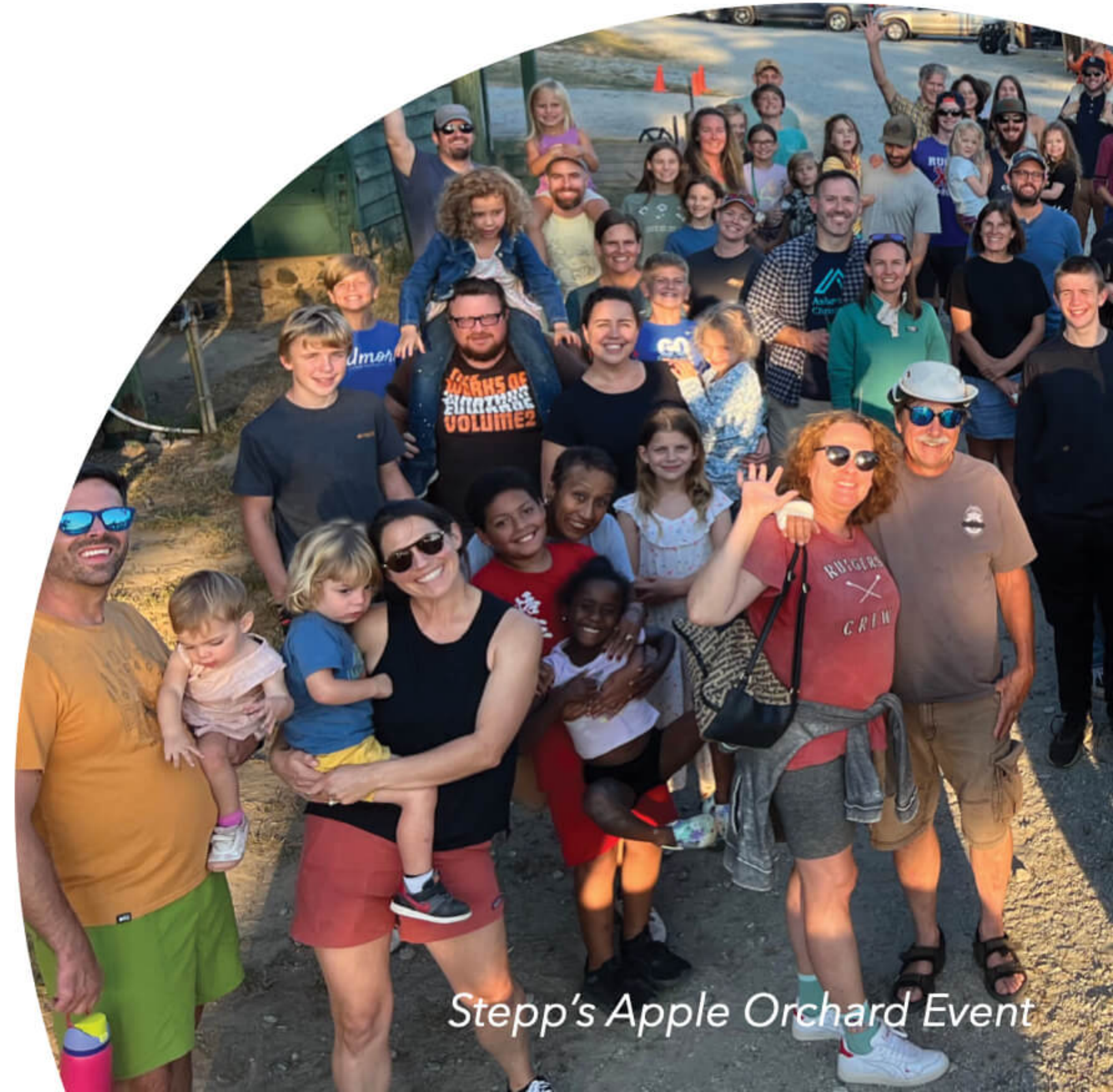
Stepp's Apple Orchard Event