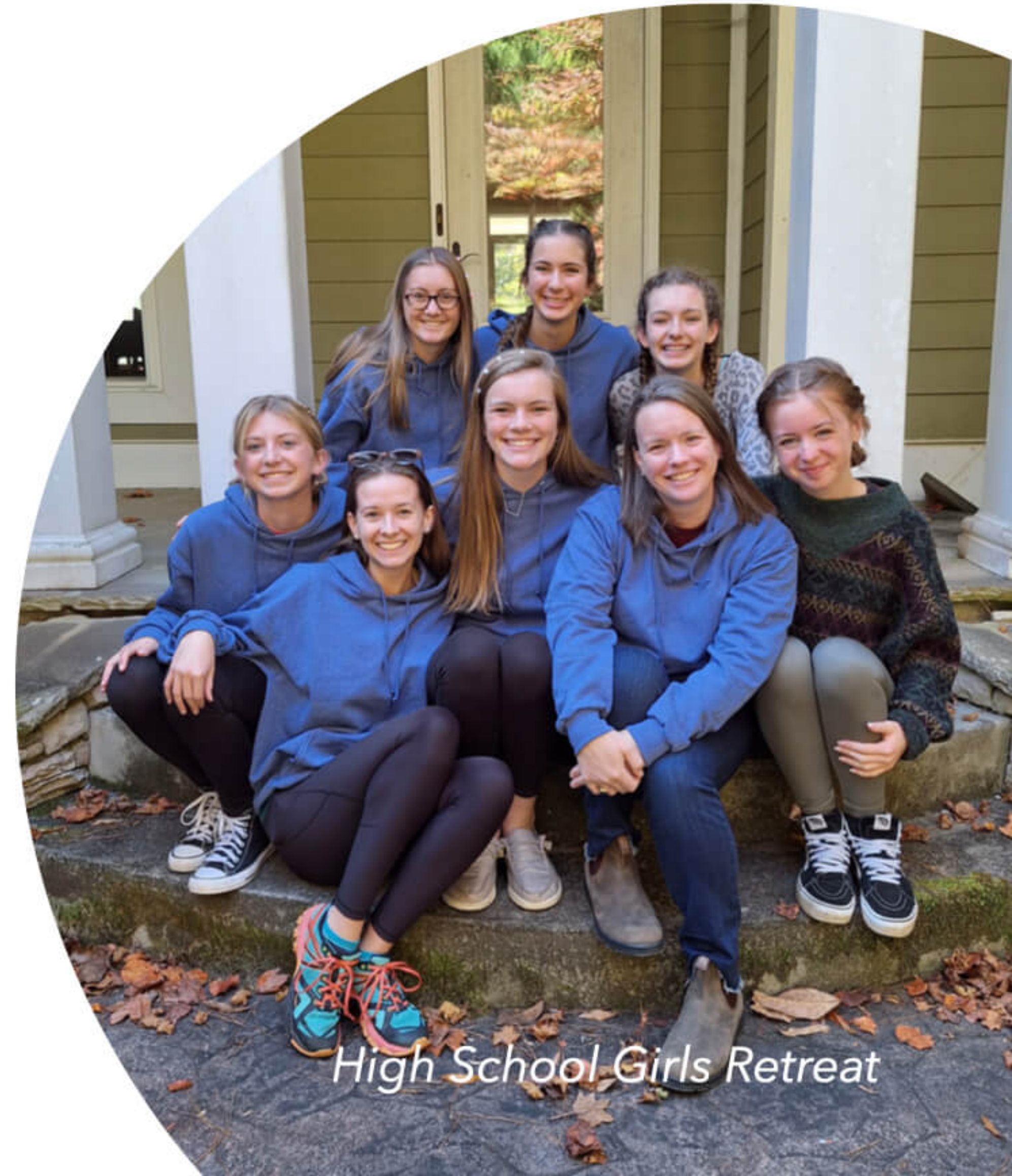
High School Girls Retreat