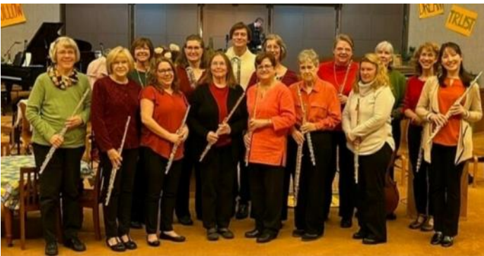
Lancaster Flute Ensemble