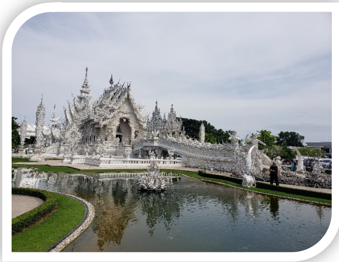
Buddhist Temple in northern Thailand