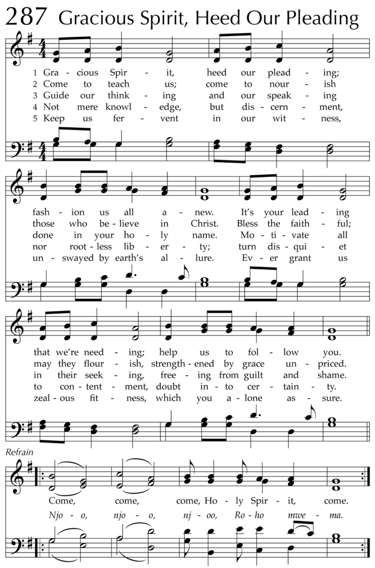
Originally written for the uniting of the Lutheran churches in Tanzania, this prayerful hymn touches on the need of the whole church at all times for the Holy Spirit's guidance and blessing. When appropriate, the refrain can effectively be used alone as a prayer response.