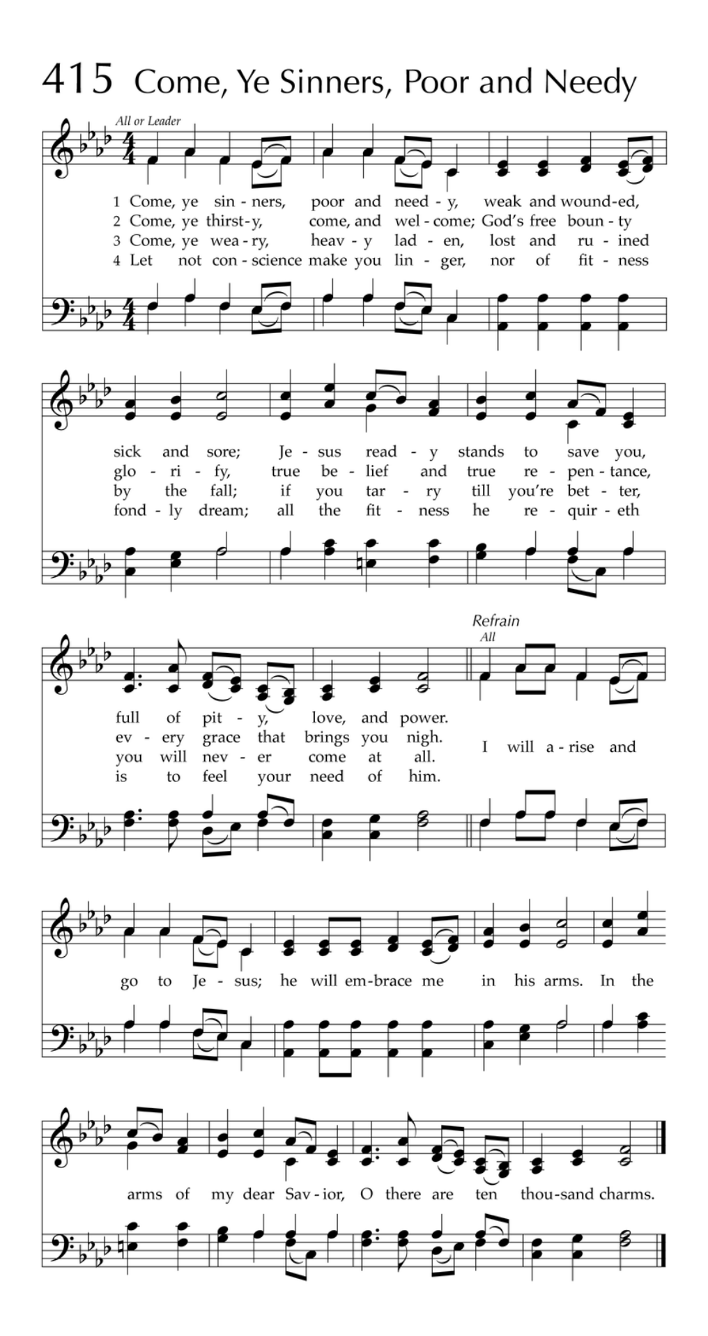
The differing voices of this text indicate that its parts were not created together. The stanzas are cast in the voice of a preacher or exhorter, but the refrain (added later) takes the voice of a penitent heeding that call in language like that of the Prodigal Son (Luke 15:18).