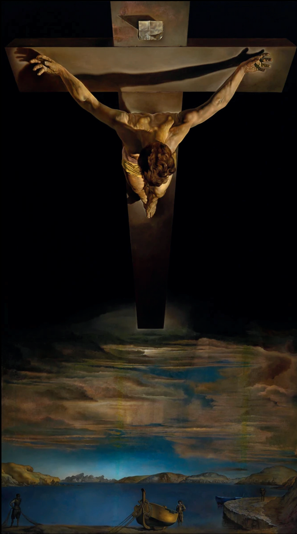
Salvador Dalí Christ of Saint John of the Cross, c. 1951.